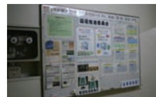
Environmental Bulletin Board in Fujinomiya Factory

Terumo's Fujinomiya Factory installed an Environmental Bulletin Board in fiscal 2007 and has since been updating it monthly. The bulletin board displays useful information related to global environmental conservation, complete with graphs and illustrations. Subjects covered include the environmental impact of the entire factory (e.g., trends in energy consumption and the status of waste emissions), the mechanism behind global warming and energy-saving activities. The use of the board has helped raised the environmental conscious of associates, leading to greater participation in environmental activities.