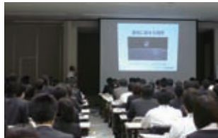
Training for newly hired associates

Once a year in Japan, we provide environmental training for our newly hired associates to ensure that they have a thorough understanding of our Basic Environmental Policy and their own obligations with regard to environmental activities. In fiscal 2008, we organized training for MRs (Medical Representatives) that focused on how to conduct everyday tasks in an environmentally friendly manner as well as on relevant environmental laws and regulations.